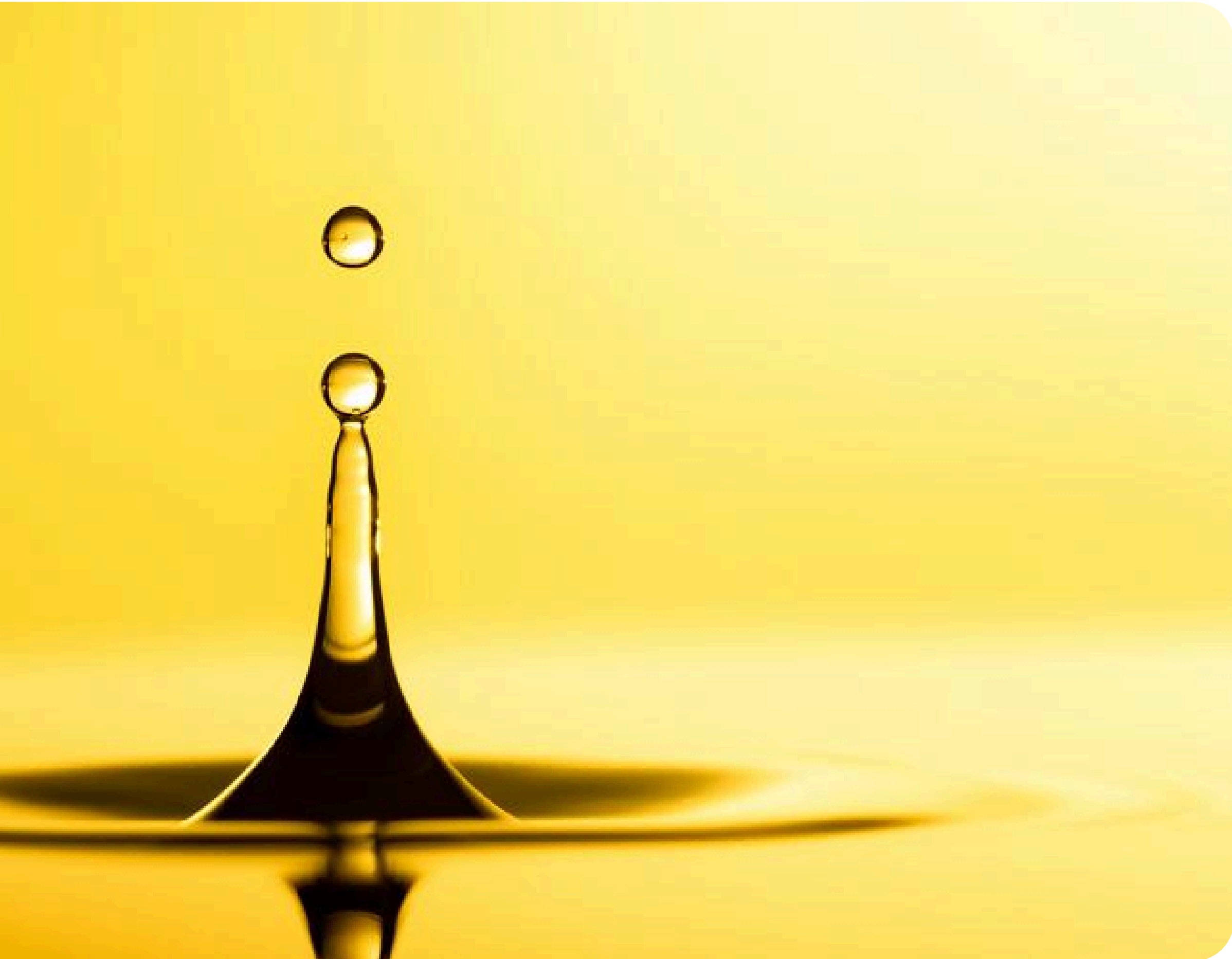
Table of- Contents.